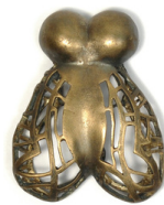
364/37 Brooch Yellow-bronze 43 x 34 x 11mm