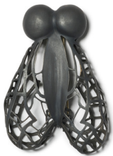
364/19 Brooch Silver 85 x 59 x 15mm