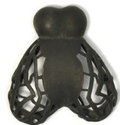
364/29 Brooch Silver, gold 837x 35 x 10mm