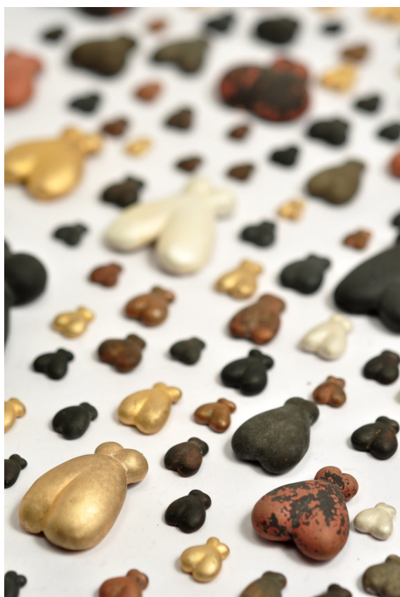
Swarm of 22 small flies, pins Bronze, Silver, Copper 14 x 10 x 3 mm