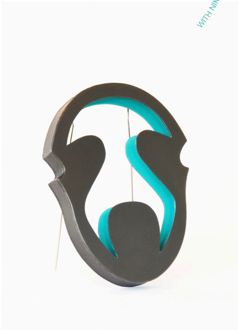
WITH NIKLAS LINK „ICON“ BROOCH, 2017