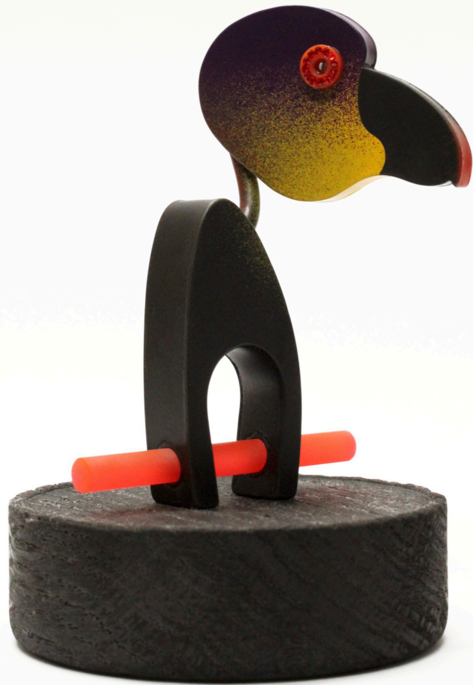
WITH NIKLAS LINK „VULTUR_01“ RING-SCULPTURE, 2021