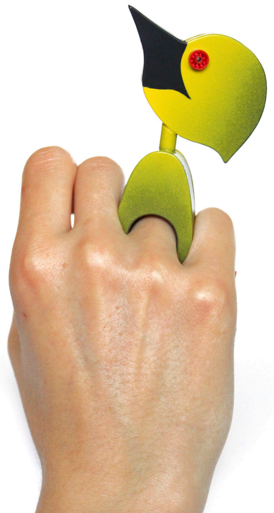
WITH NIKLAS LINK "PSITTACIFORMES_05" RING-SCULPTURE, 2020